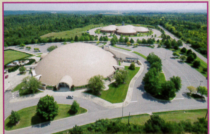
Faith Chapel Christian Center and The Bridge's sprawling campus in Birmingham, AL