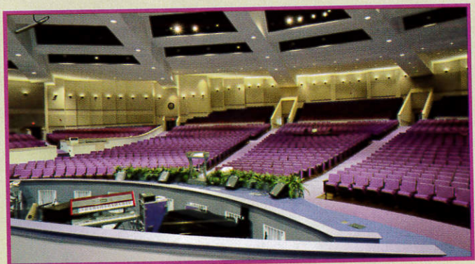
The Faith Chapel Christian Center sanctuary

The Bridge is closed on weekends other than for private events. Tuscany Lanes hosts a fun league on Monday nights and has open bowling on Tuesday and Thursday evenings. The Tuscany Café is open to the public for lunch Tuesday through Thursday, dinner on Tuesdays and Thursdays, and to private and special events at other times.