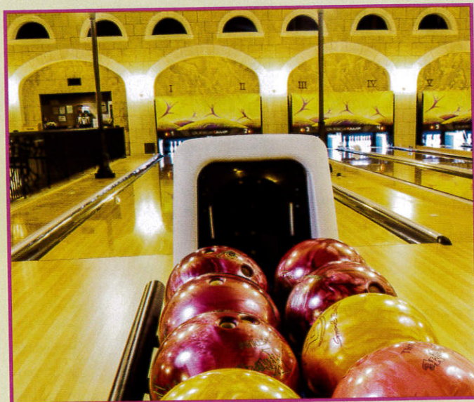
Tuscany Lanes at The Bridge is part of a larger faith-based entertainment and event center

Tuscany Lanes shares its almost 20,000-square-foot dome with the popular Tuscany Café which has a commercial kitchen. Its unique style features designs reminiscent of Tuscany, Italy, including arched concrete pillars directly above the lane approaches and above and behind the lanes. Streetlight poles are lined up halfway down the walkways between the lanes and