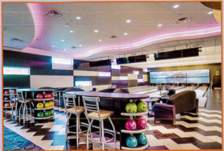
Epic Bowling at Riverside EpiCenter