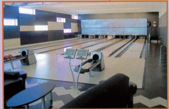
Epic Bowling at Riverside EpiCenter is just one of many entertainment offerings